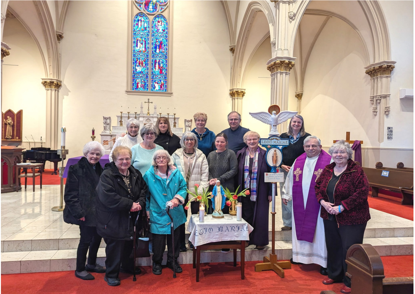
Photo is from the March 22 Holy Hour of the Legion of Mary.

Welcome! If you attend Mass here regularly, we invite you to become an official member of Most Holy Name of Jesus Parish. Registering allows us to better serve your pastoral needs. Please pick up a registration from in the back of church. Or contact the parish office for more information on how to join. The Parish Office is located at 1010 Davis Street, Elmira NY (607) 733-3484.